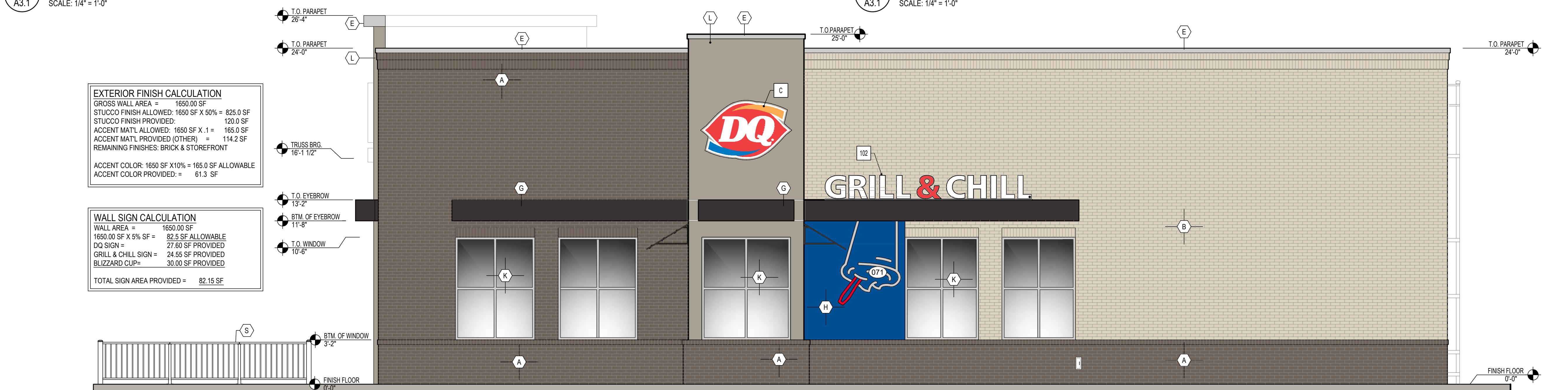
3 SOUTH (ENTRANCE) ELEVATION A3.1 SCALE: 1/4" = 1'-0"

EXTERIOR FINISH CALCULATION GROSS WALL AREA = 824.00 SF STUCCO FINISH ALLOWED: 824SF X .5 = 412.0 SF STUCCO FINISH PROVIDED: 89.0 SF REMAINING FINISHES: BRICK & STOREFRONT