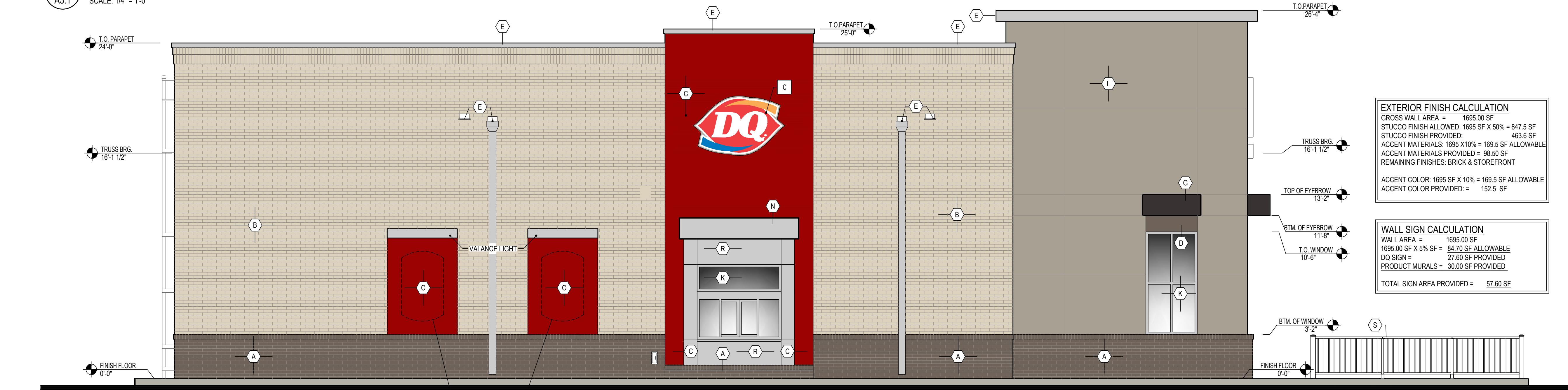
4 NORTH (DRIVE-THRU) ELEVATION A3.1 SCALE: 1/4" = 1'-0"

WALL SIGN CALCULATION WALL AREA = 1650.00 SF 1650.00 SF X 5% SF = 82.5 SF ALLOWABLE DQ SIGN = 27.60 SF PROVIDED GRILL & CHILL SIGN = 24.55 SF PROVIDED BLIZZARD CLIP = 30.00 SF PROVIDED TOTAL SIGN AREA PROVIDED = 82.15 SF