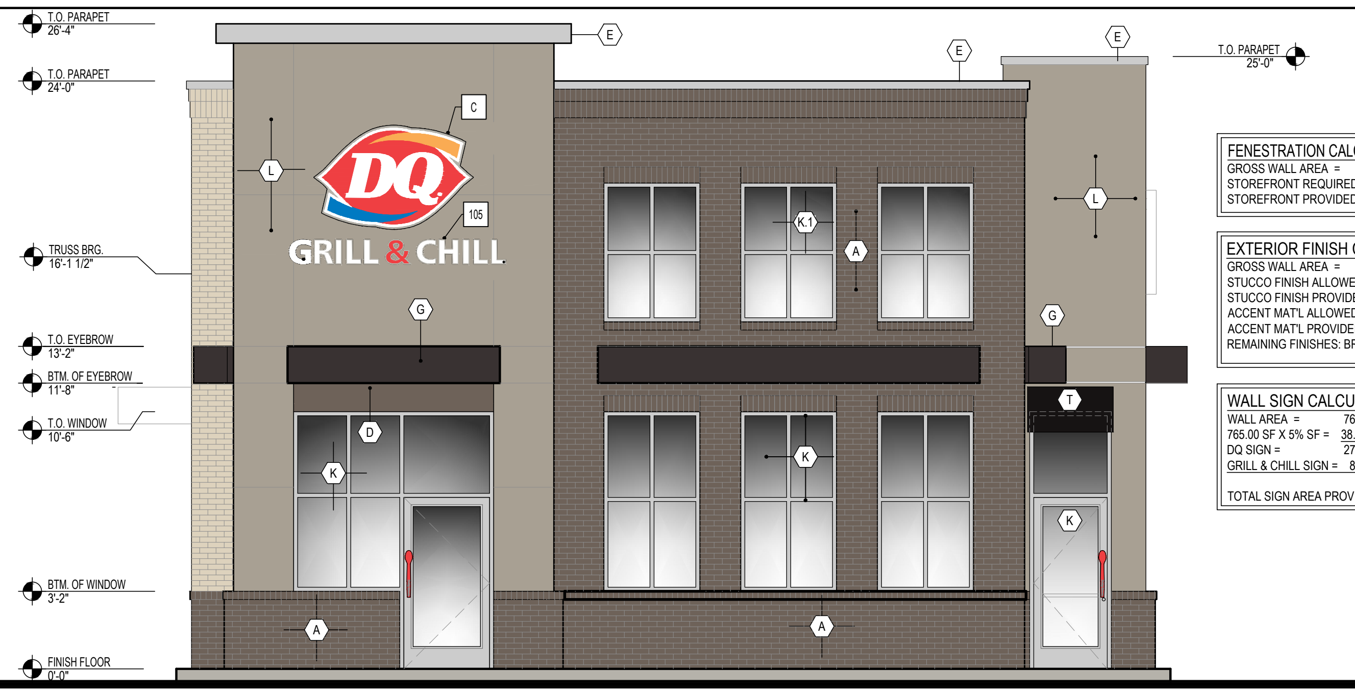
1 WEST (FRONT) ELEVATION A3.1 SCALE: 1/4" = 1'-0"

FENESTRATION CALCULATION (STATE RTE) GROSS WALL AREA = 765.00 SF STOREFRONT REQUIRED: 765SF X .3 = 229.5 SF STOREFRONT PROVIDED: 231.0 SF