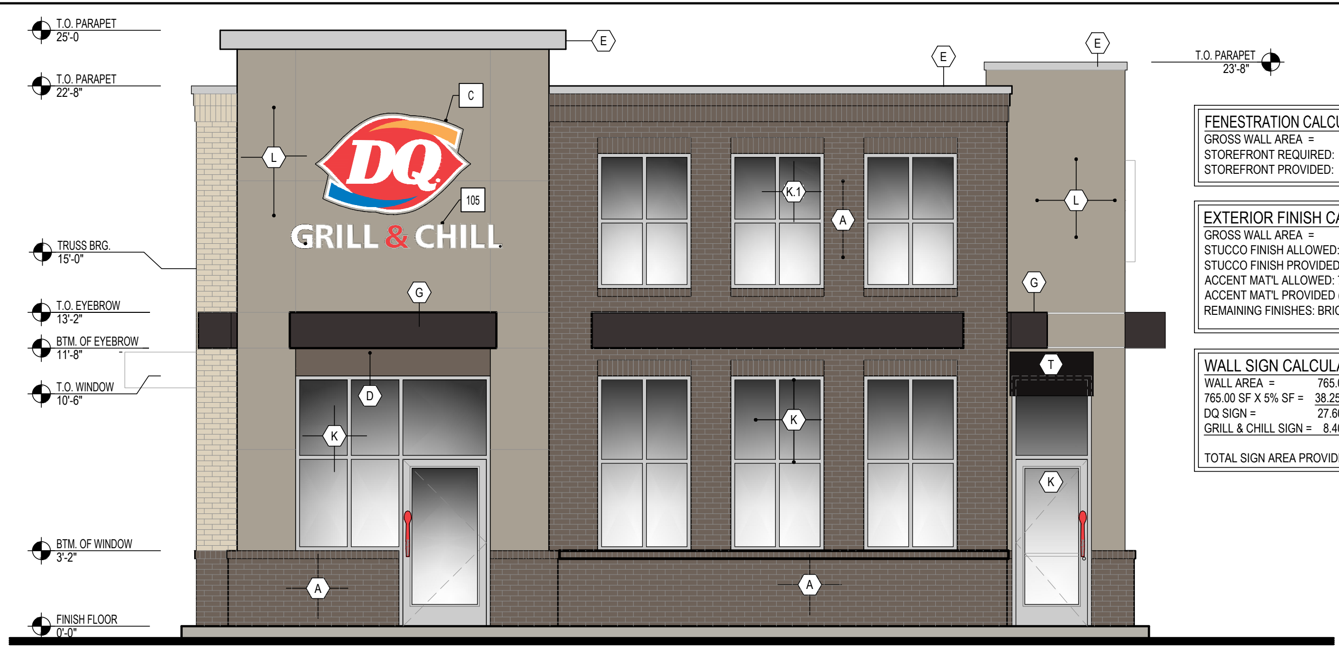
1 WEST (FRONT) ELEVATION A3.1 SCALE: 1/4" = 1'-0"

FENESTRATION CALCULATION (STATE RTE) GROSS WALL AREA = 765.00 SF STOREFRONT REQUIRED: 765SF X .3 = 229.5 SF STOREFRONT PROVIDED: 231.0 SF EXTERIOR FINISH CALCULATION GROSS WALL AREA = 765.00 SF STUCCO FINISH ALLOWED: 765SF X .3 = 229.5 SF STUCCO FINISH PROVIDED: 215.4 SF ACCENT MATL ALLOWED: 765 SF X .1 = 76.5 SF ACCENT MATL PROVIDED (OTHER) = 36.4 SF REMAINING FINISHES: BRICK & STOREFRONT WALL SIGN CALCULATION WALL AREA = 765.00 SF 765.00 SF X 5% SF = 38.25 SF ALLOWABLE DQ SIGN = 27.60 SF PROVIDED GRILL & CHILL SIGN = 8.40 SF PROVIDED TOTAL SIGN AREA PROVIDED = 36.00 SF