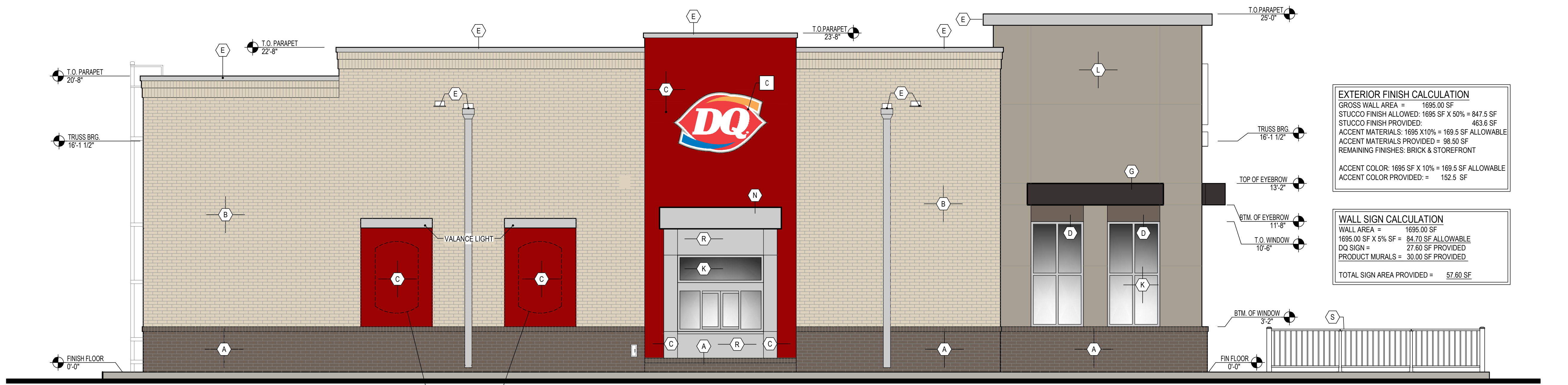
4 NORTH (DRIVE-THRU) ELEVATION A3.1 SCALE: 1/4" = 1'-0"

WALL SIGN CALCULATION WALL AREA = 1695.00 SF 1695.00 SF X 5% SF = 84.75 SF ALLOWABLE DQ SIGN = 27.60 SF PROVIDED PRODUCT MURALS = 30.00 SF PROVIDED TOTAL SIGN AREA PROVIDED = 57.60 SF